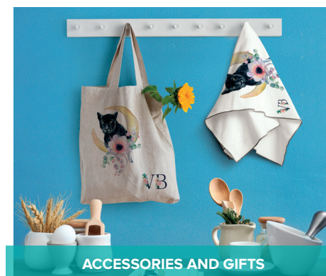
ACCESSORIES AND GIFTS