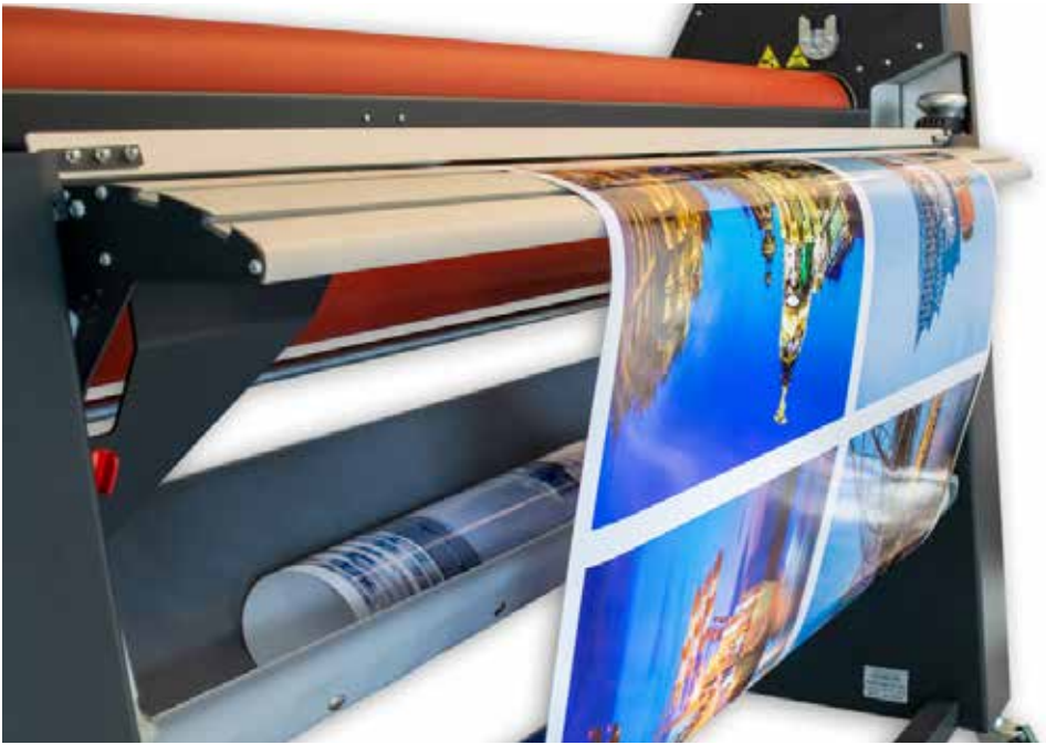
Roll to roll lamination