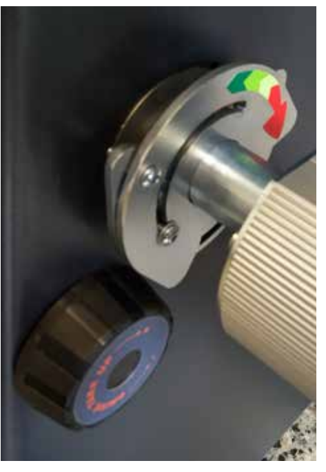
Brakes and slip clutches for all axles