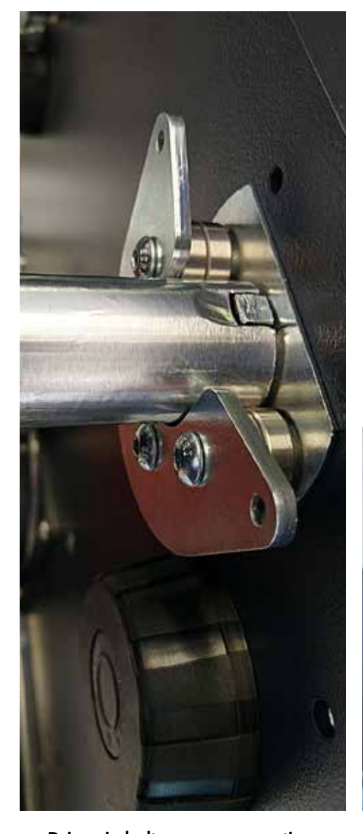
Drive via bolt-groove connection