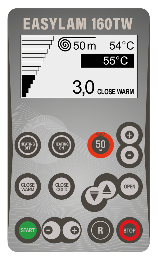
Simple operation through intuitive keyboard.