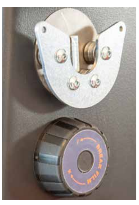
Ergonomic rotary knobs