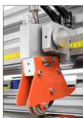
Slimline lengthwise rotary crush cutter, single or twin, (optional)