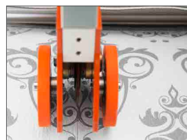
Single lengthwise rotary crush cutter (twin cutters optional)