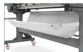
Clean working area thanks to the big waste basket