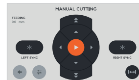
User-friendly software design