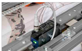
Advanced cutting mark reader