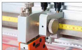
Fine positioning of the cutting blades ( NEW standard)