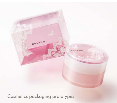
Cosmetics packaging prototypes

RIP & PRINT MANAGEMENT SOFTWARE Roland VersaWorks®