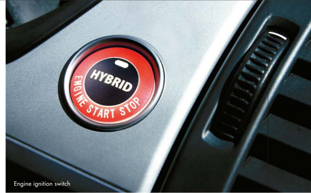
Engine ignition switch